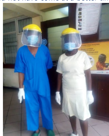
Staff who attended to a suspect case at a project facility in Nigeria

Across the continent, countries are beginning to lift some of the restrictions they had put in place to curb imported and community infections. In Kenya, while the curfew and movement restrictions on some counties are still in place, life seems to be going back to normal. Anne Kanyi of CHAK notes that a number of projects for example, have been resumed. As early as last week, Cameroon had eased its restrictions. Nigeria has followed suit.