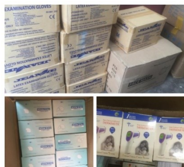
Some of the supplies from the IMA project

"There is growing community transmission following the ease of lockdown, and because of the dense population in some parts of the country, transmission is rapid," noted CHAN's Kelechi Utoware.