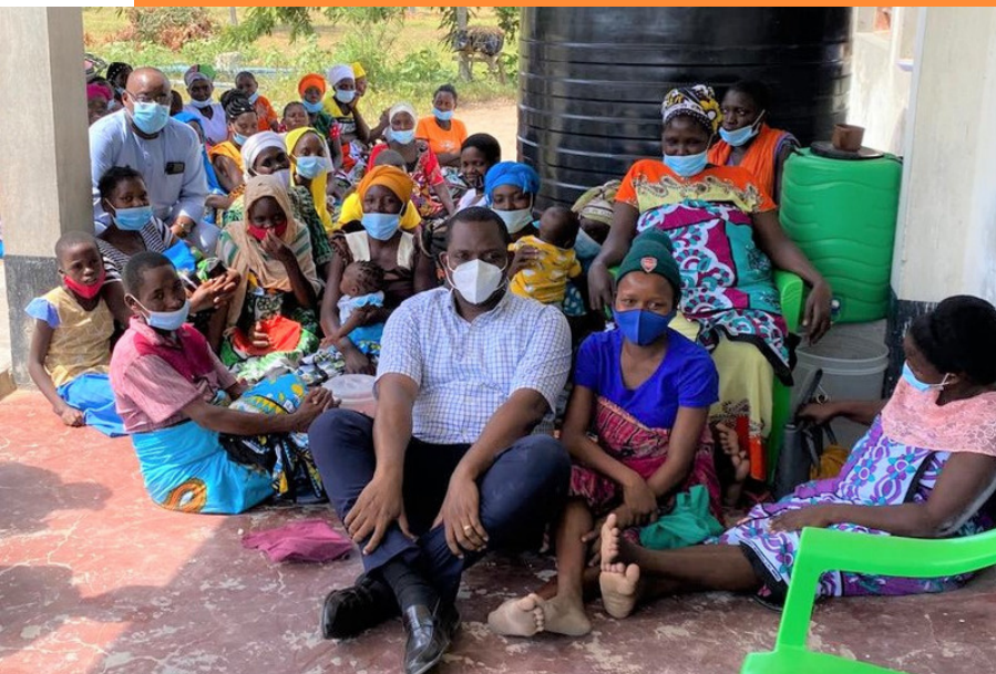
ACHAP board at a field activity in Kilifi