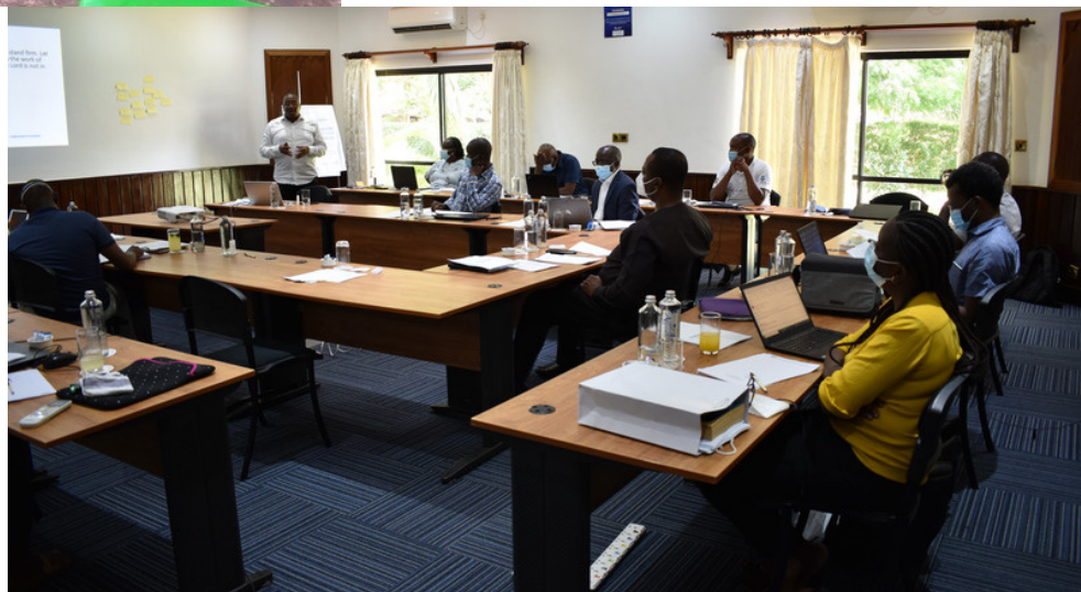
ACHAP board and staff at the strategic planning retreat