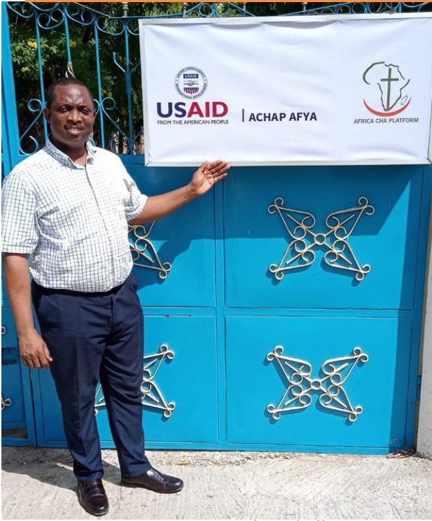
ACHAP board visit to ACHAP Afya Kilifi office