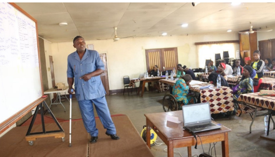
OPD leader presenting advocacy action plan

Bridging the gap between these two groups has proven a key step towards synergy, and has facilitated measures for inclusion of PWDs including adjusting activity time to enable participation by persons with disabilities, accessibility features in target locations, adapting tasks to the needs of PWDs, and providing/involving personal assistants to ease their work.