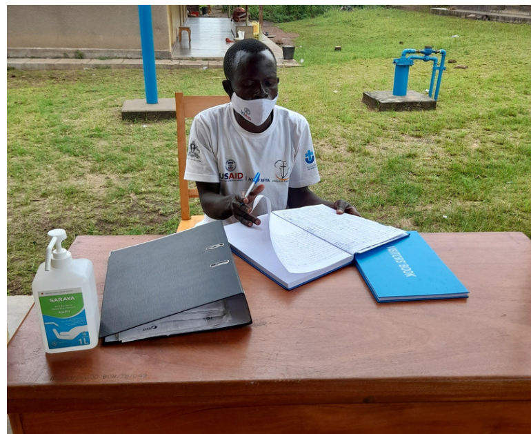
VHT helpdesk in Arua

In the community health units we serve, one of the first things you might notice is the VHT help desk at the facility, where patients go for enquiries and information before setting up doctors' appointments. The help desk makes processes easier by reducing the queues at healthcare facilities, and registering patients for at-home follow up.