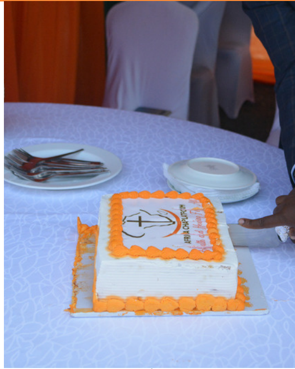
Cake cutting at the ACHAP Afya vehicle dedication service