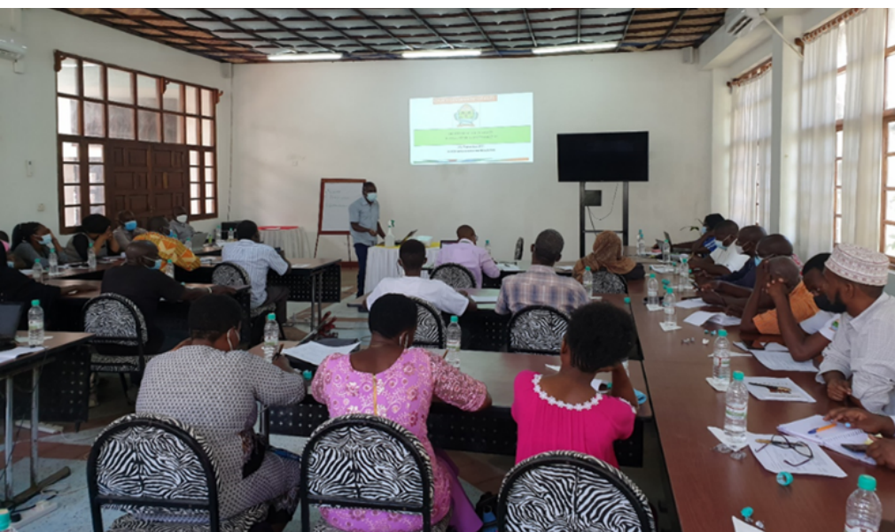
Face-to-face dialogue in Kilifi County

Addressing the negative bias from religious leaders in their engagement with the LGBTQ community, including people living with HIV in social activities especially in places of worship, integration of HIV services in health facilities to prevent discrimination, and use of appropriate language by healthcare workers in the administration of HIV care.