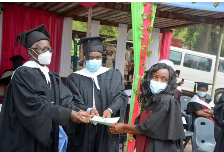
NMT at Trinity College receiving her diploma