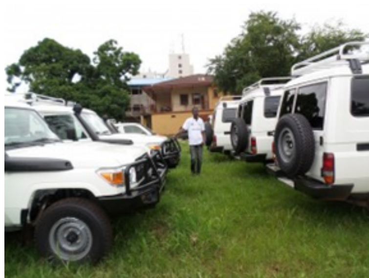
Medical supplies and ambulances received at CHASL's member facilities