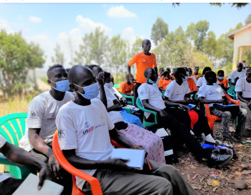
VHT monthly review meeting in Ndhew Sub-county, Uganda