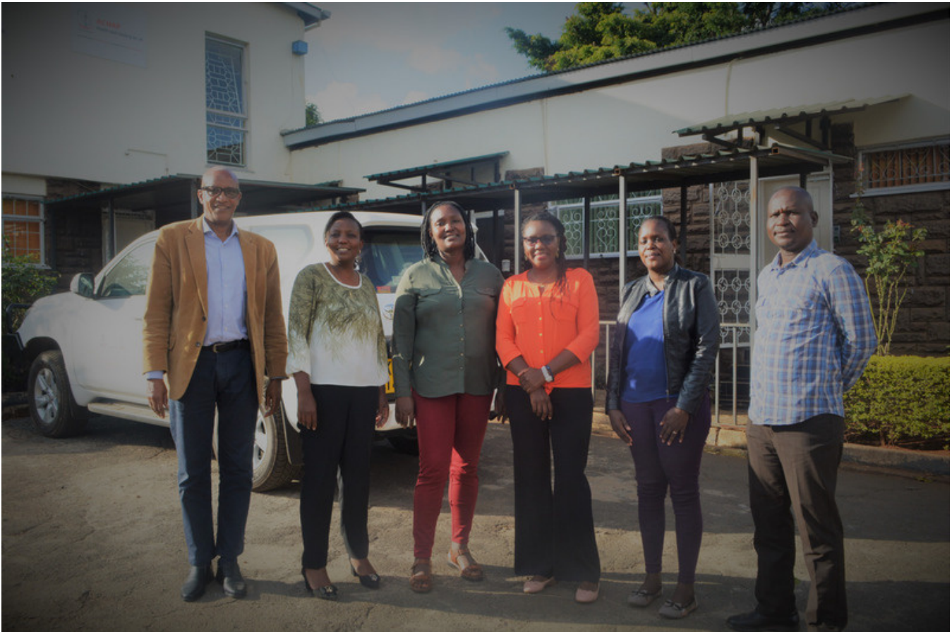
Meeting with BUFMAR team at the ACHAP office