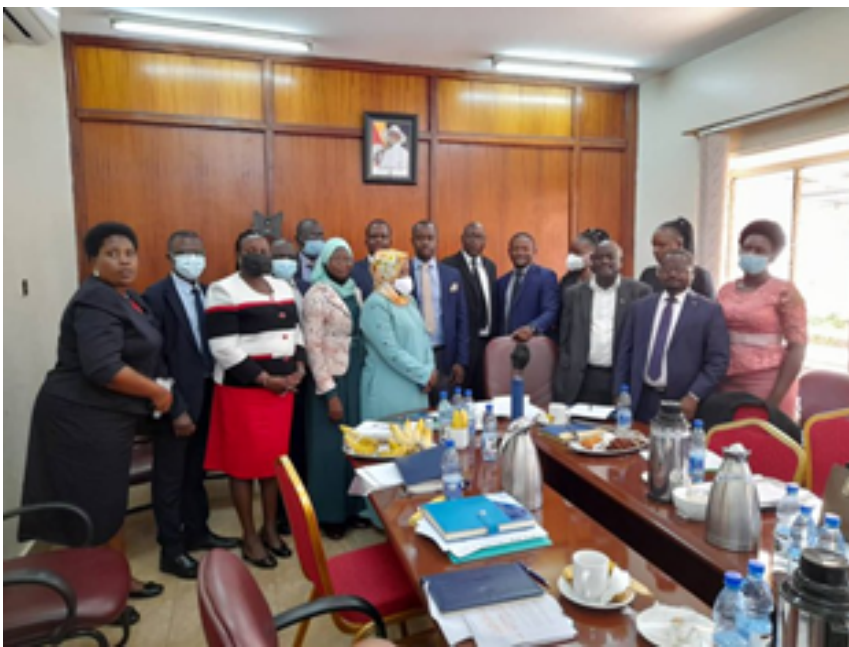
FBO representatives at the Ugandan Parliament

Representatives of Faith based Medical Bureaus in Uganda convened in parliament to present an Inter-Medical Bureau Coalition (IBC) memorandum on the proposed amendments to the Public Health Bill. ACHAP was aptly represented by our members, Uganda Protestant Medical Bureau and Uganda Catholic Medical Bureau.