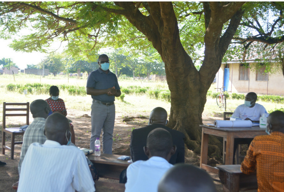
Emanzi Plus orientation session in Uganda

The Emanzi Plus curriculum is modeled by JSI Research & Training Institute after the evidence-based Men as Partners curriculum designed by EngenderHealth.