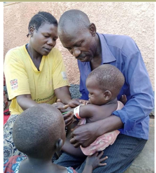
MUAC tape demonstration in Uganda