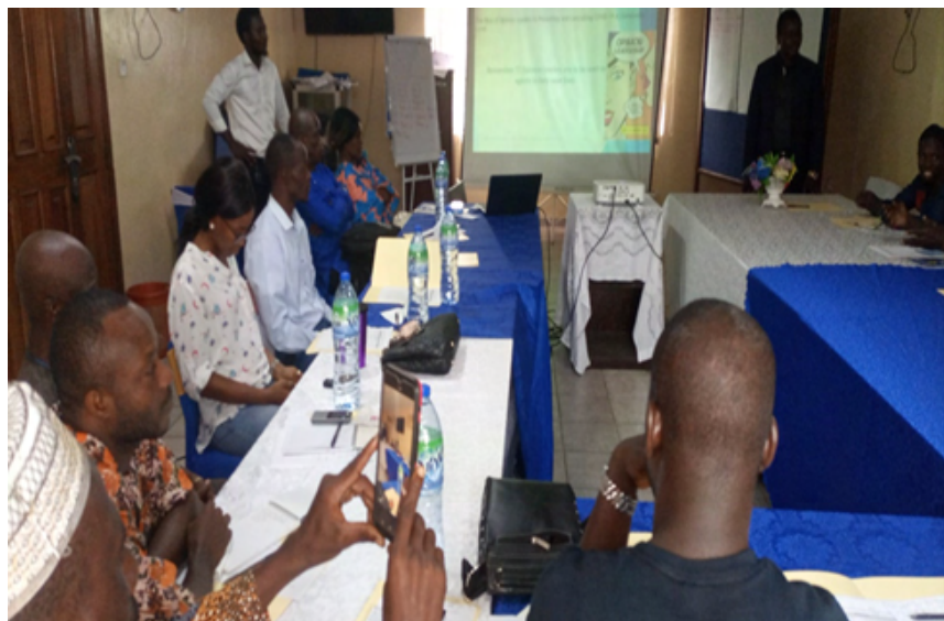
Information and advocacy meeting; Inter-religious council-CHASL

In the course of these gatherings, an advocacy agenda was developed, and Faith-leader champions selected to support CoV-FaB activities through providing evidence-based information to congregants and the rest of the communities. These efforts are aimed at reduction of COVID-19 morbidity and mortality in Africa, and strengthening the capacity of Christian Health Associations to respond to future health emergencies.