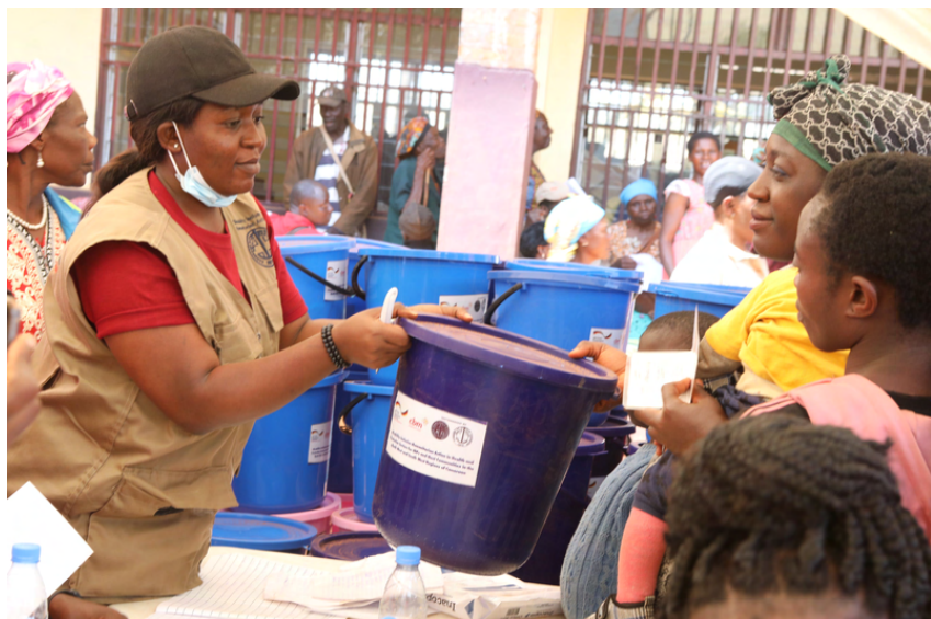
Commemoration of the International Day for People with Disabilities in Cameroon, led by ACHAP member CBCHS.