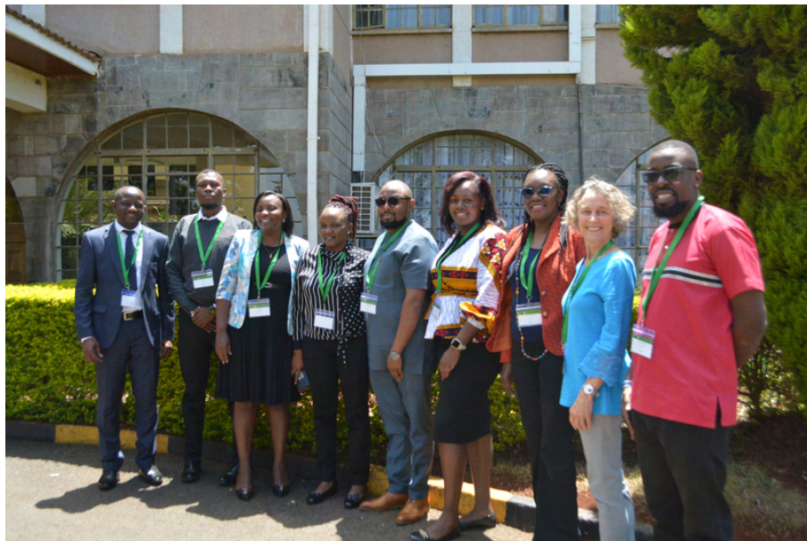
ACHAP delegation at the EPN Forum in Nairobi, Kenya.