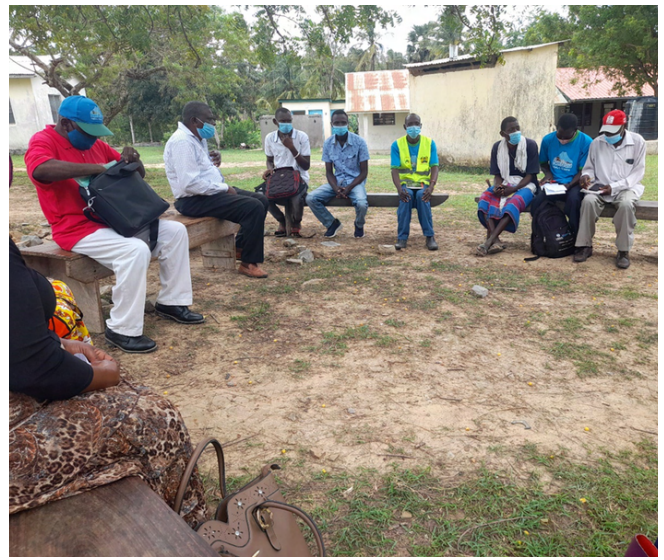
Training men as GBV champions in Kilifi