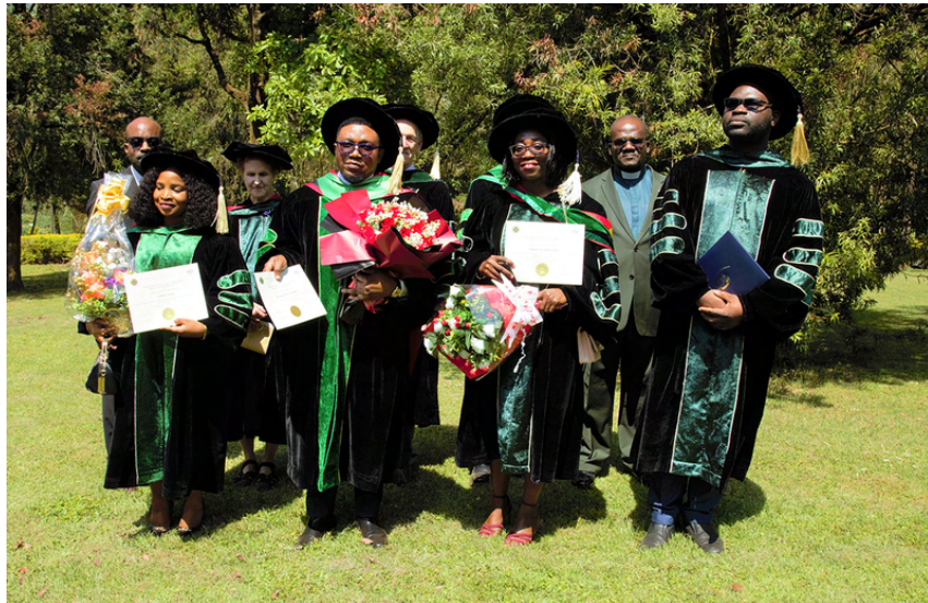
The graduating class with CBCHS and BIHS administrators.

The graduates will be proceeding to join the health workforce of Cameroon, and will remain important contacts for CBCHS. Our hearty congratulation to all of them!