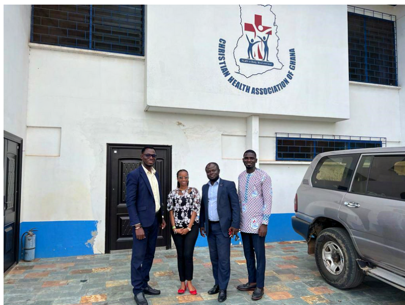
Courtesy visit to CHAG office in Accra, Ghana.