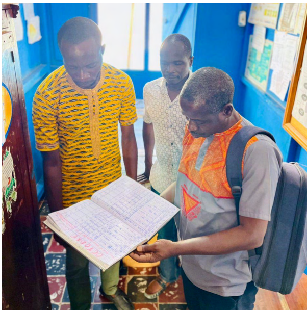
Data verification exercise during the HHA monitoring visit in Côte d'Ivoire