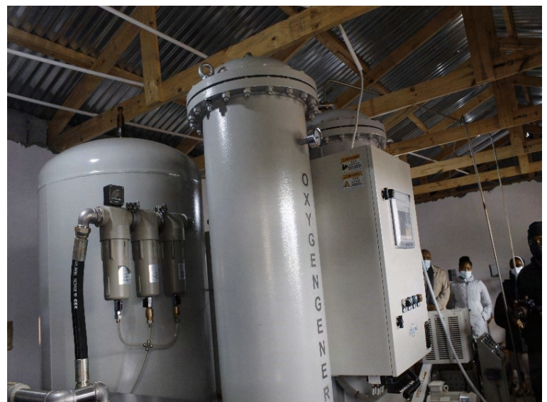
The Paray Mission Hospital COVID ward and oxygen plant.