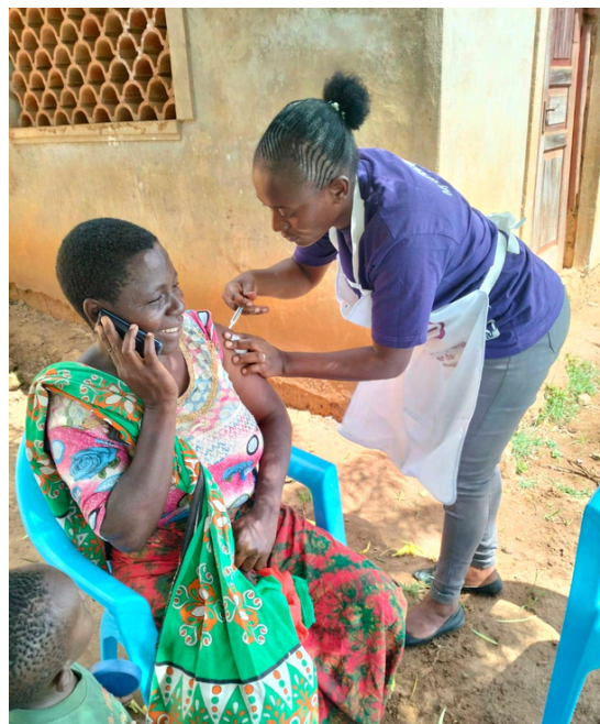
A recipient of the ACHAP Afya CBDFP in Kilifi County