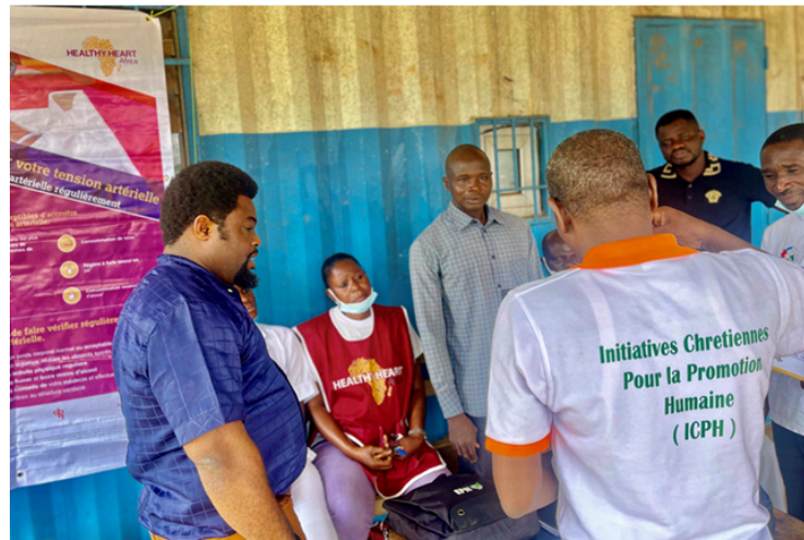
On-site mentorship and coaching of community health volunteers during the technical support and monitoring visit

The Healthy Heart Africa programme is expanding to 10 new countries, starting in 2023; Burkina Faso, Central African Republic, The Gambia, Madagascar, Malawi, Morocco, Mozambique, Sierra Leone, Zambia, and Zimbabwe. Over the next two years, ACHAP will be leading the expansion and implementation in 5 of the countries; CAR, Madagascar, Malawi, Sierra Leone, and Zimbabwe, continuing our efforts towards raising awareness and standardising access to NCD care and management. The existing programme in Côte d'Ivoire is nearing the end of its initial two-year cycle. To ensure quality programming, a team from HHA and ACHAP conducted a joint site visit this October for monitoring, oversight, and learning from the different experiences in the zones of intervention, which provided an opportunity to draw from evidence and experience, and to share from activity implementation what works, what does not, and why. These learnings are quite timely, and will be applied across activities as the programme's reach expands.