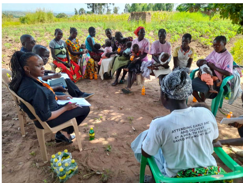
Dialogue meeting with teenage mothers in Ewaa Parish, West Nile.