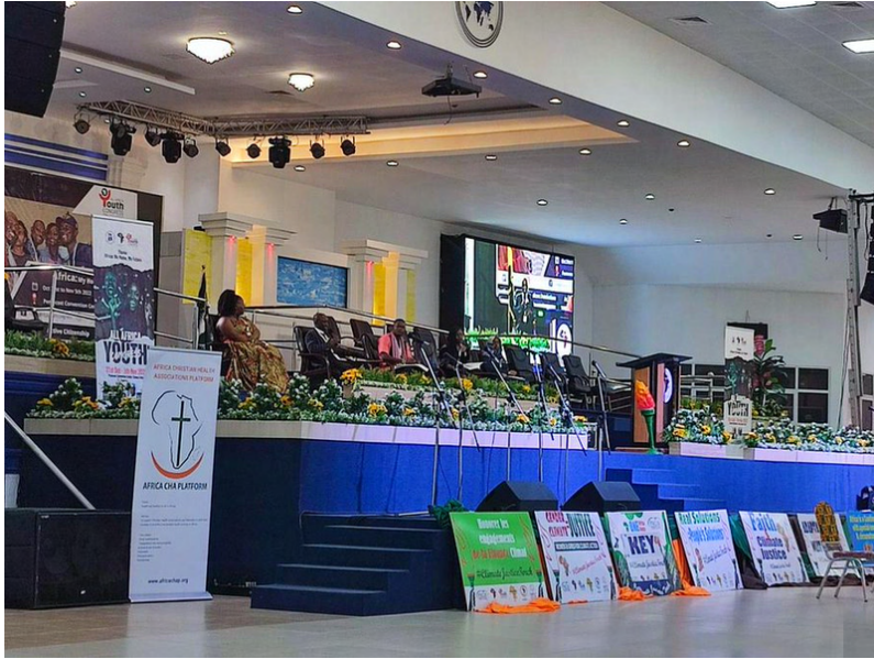
ACHAP represented at the All Africa Youth Congress in Kasoa, Ghana.