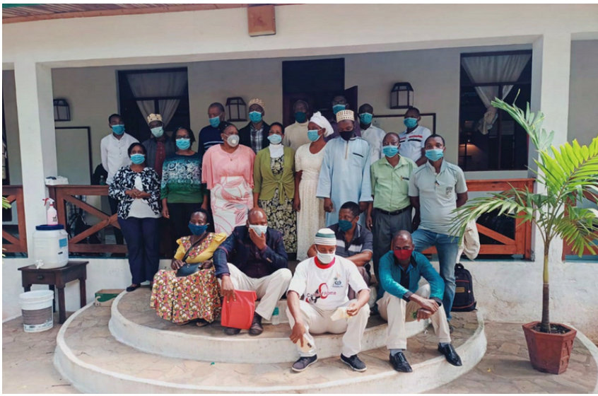
Religious leaders' training on GBV in Kilifi County