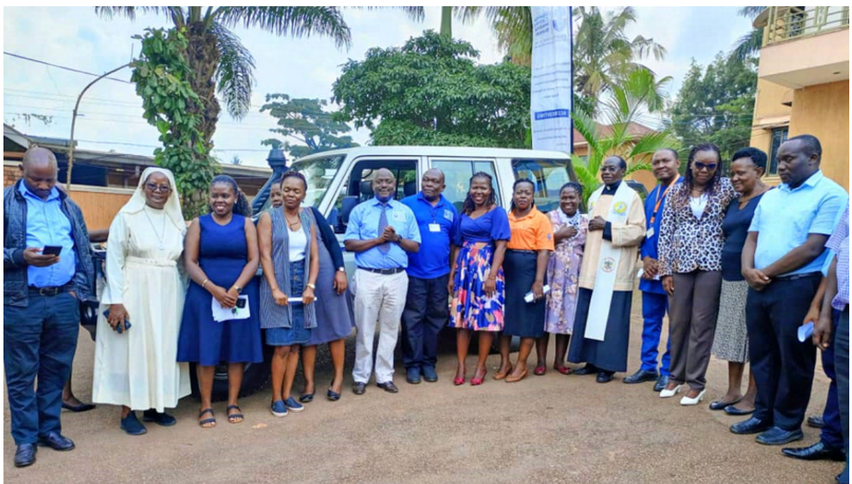
The ACHAP Uganda team receiving the vehicle in Kampala, Uganda.