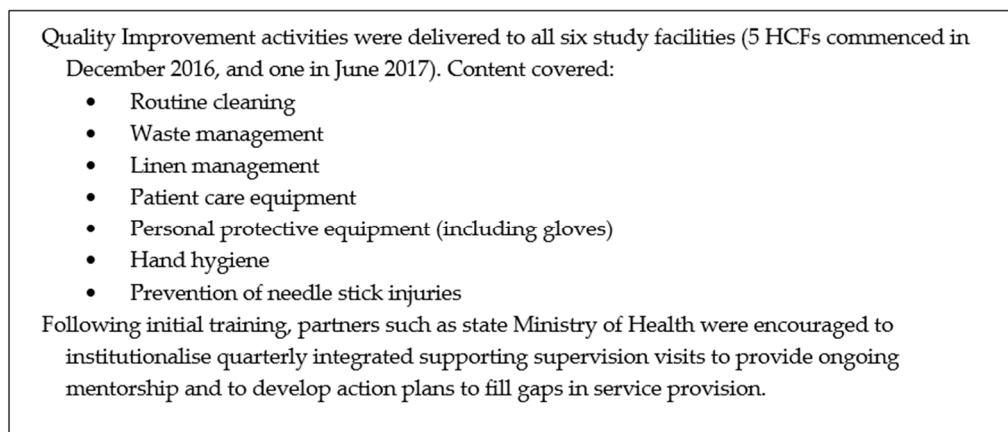
Figure 1. Details of Maternal and Child Survival Program (MCSP)-support quality improvement (QI) programming. HCF: healthcare facility.

essential newborn care, and quality of care. Time dedicated to hand hygiene training was limited during the training programme. For example, it constituted just 10 min of the essential newborn care course and did not include skill practice. More specific quality of care improvements are detailed in Figure 1.