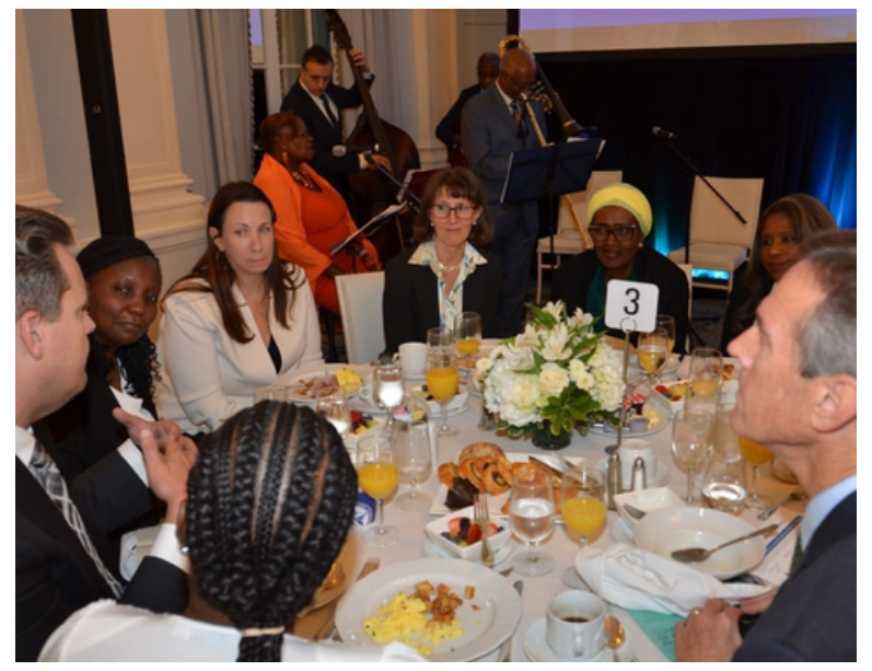
ACHAP at the faith communities breakfast during the UNGA in New York.