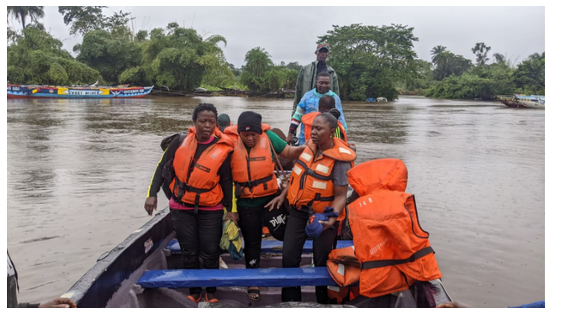
CHWs in Cameroon braving harsh weather conditions to reach zerodose children.