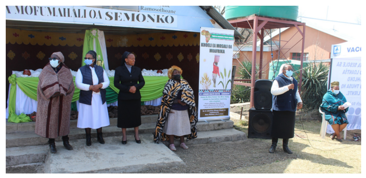
Health practitioners at St. Leonard's hospital leading a sensitisation session at the workshop.

The core purpose of the event was to create awareness for cervical cancer and build confidence among women to take charge of their health and wellbeing.