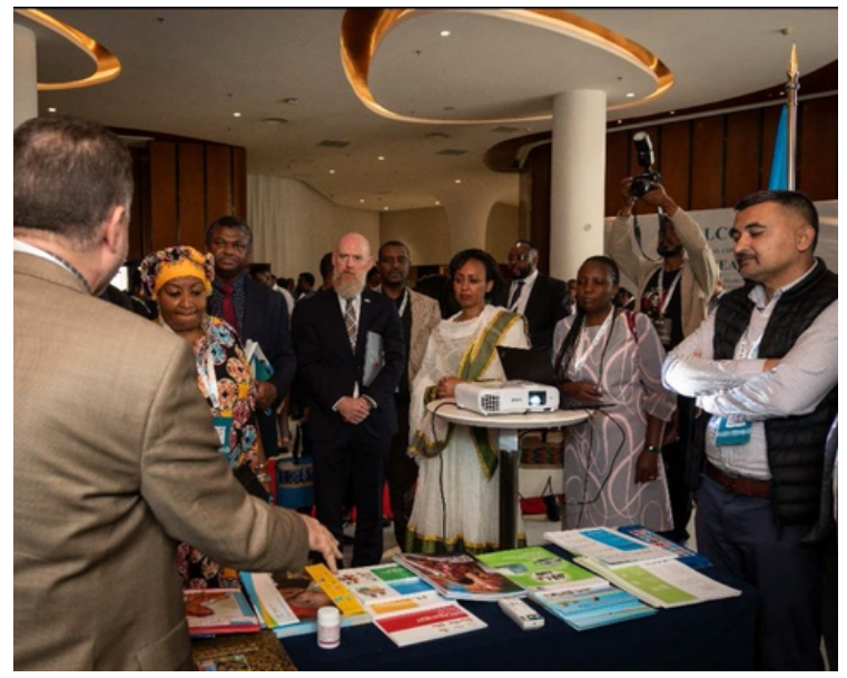
Discussions on Primary Healthcare at the ICPHC in Addis Ababa.