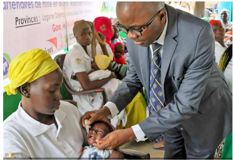
R4S Vaccination outreaches in Burkina Faso and Chad