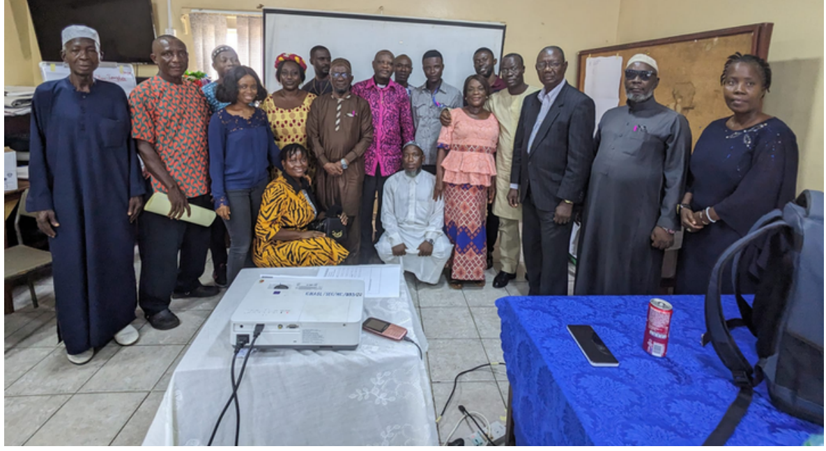
CHASL staff and religious leaders at the advocacy meeting.

The is part of a broader effort to empower religious leaders with the knowledge and skills needed to effectively disseminate messages about healthy timing and spacing within their communities.