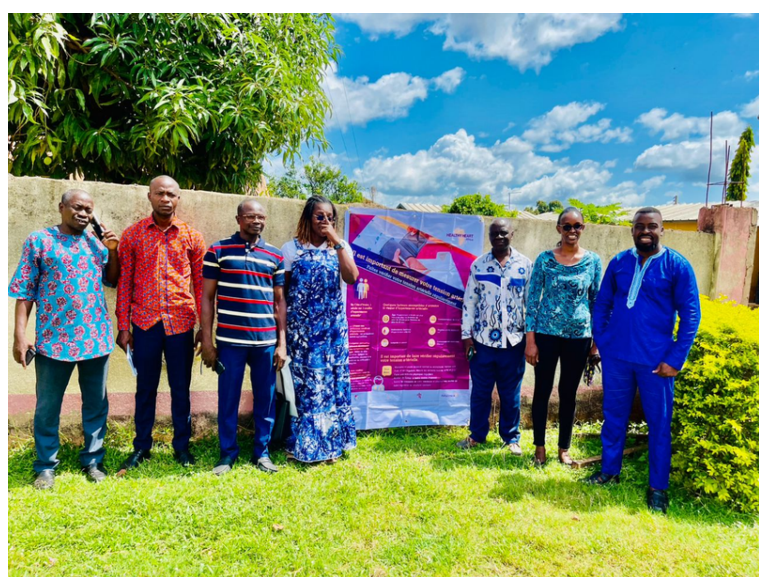
ACHAP Finance and M&E support supervision visit to ICPH in Korhogo, Côte d'Ivoire