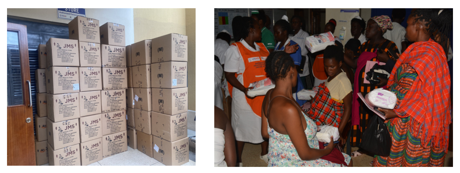
Distribution of maternity kits at Kawempe National Referral Hospital..

Joint Medical Store, our DSO member in Uganda, donated maternity kits to the Kawempe National Referral Hospital. This donation was made as part of the organisations social responsibility in support of 80 new mothers. who were also educated on the importance of maternity pads and post-delivery hygiene.