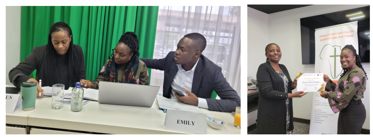
ACHAP staff and CHA representatives at the training.

In August, ACHAP collaborated with Internews and Corus International to organize a three day training on emergency preparedness and response for a number of our members CHAs. The Emergency Preparedness and Response Training, powered by the Cov-FaB project, saw country teams from Liberia, Madagascar, Tanzania, Zambia, Zimbabwe, Central African Republic, Côte d'Ivoire, Sierra Leone, and Kenya come together to learn about disaster management, share country-specific experiences in emergency programming, and reinforce their unwavering commitment to advancing public health as a priority during global emergencies.