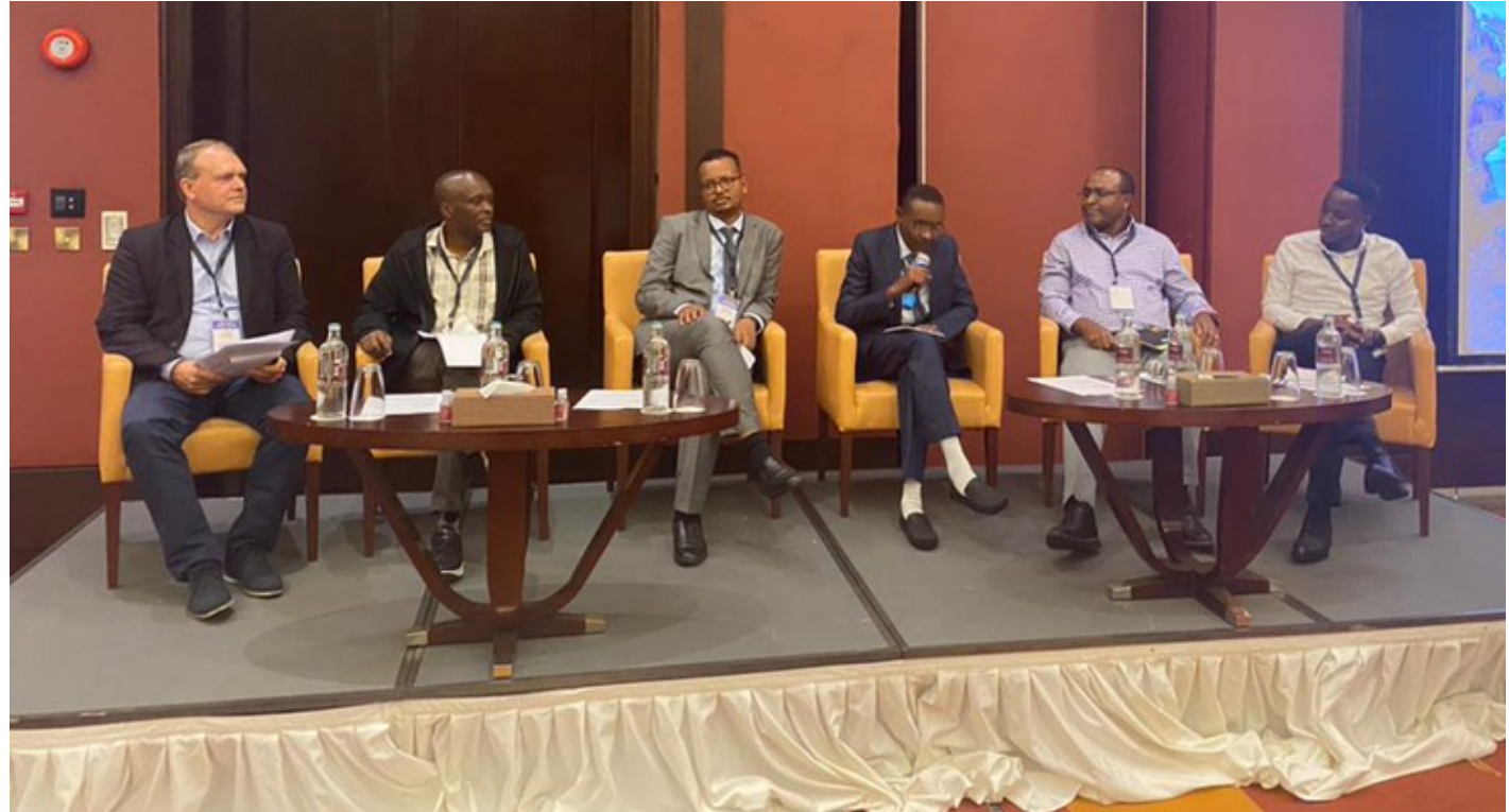
Panel discussion at the REACH workshop.

ACHAP plays a leading role in the GAVI ZIP partnership, leading zero-dose mapping and immunisation interventions in the Sahel region.