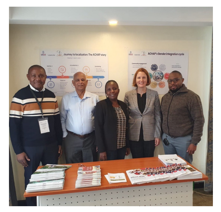
ACHAP presentation at the NPI learning forum.