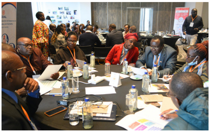
Donor round-table discussions at the dissemination meeting.

The ACHAP Afya project was the first of its kind in community programming, where focus was placed on educating Community-Own Resource Persons, who will continue to cascade interventions long after the project's life.