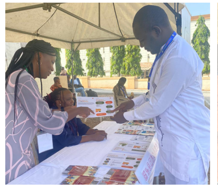
ACHAP exhibition at the conference.

Overall, this engagement did well to increase ACHAP's visibility and linkage to religious leaders and health promoting churches in Sub-Saharan Africa.