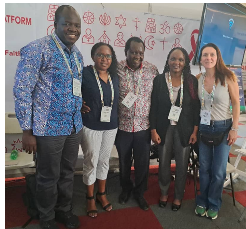
ACHAP and partners' representation at ICASA 2023 in Zimbabwe