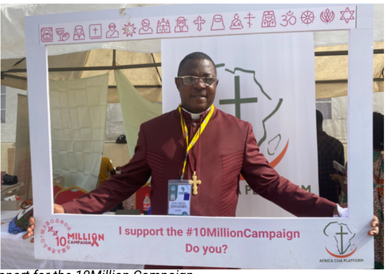
Religious leaders showing their support for the 10Million Campaign.