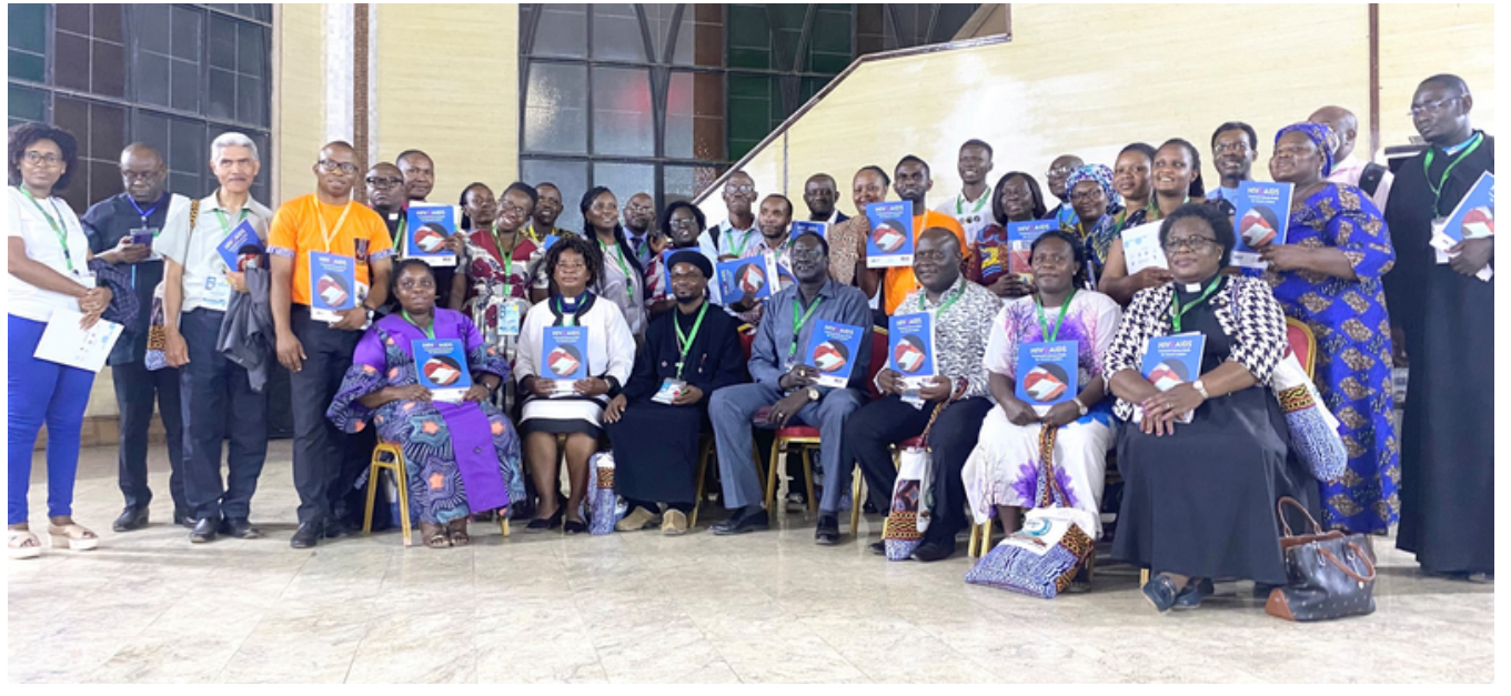
Participants at the ACHAP, EPN, and CHAN joint side event.