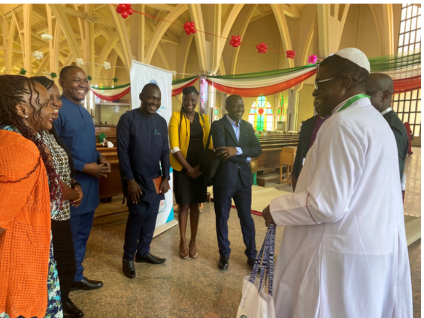
ACHAP and EPN at the AACC 60th anniversary celebration.