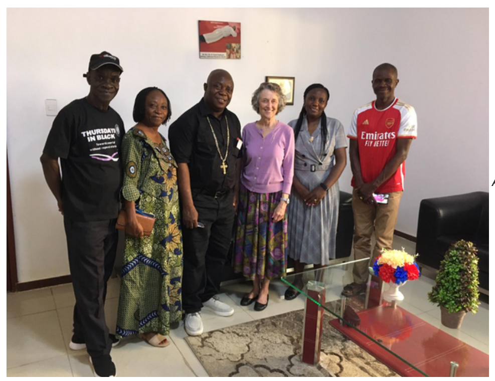
ACHAP and IMA World Health support supervision visit in Liberia.