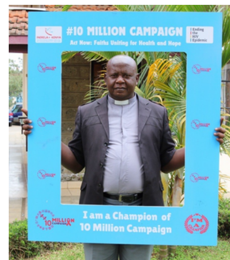
Support for the 10 Million campaign for PEPFAR during the Day of the African Child event.