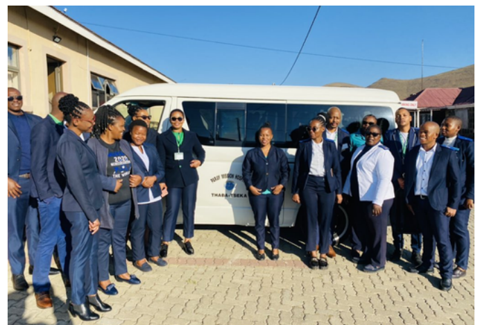
Nurses outreach at Maseru Correctional Services.