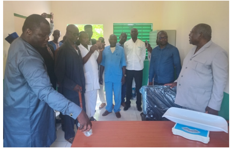
Events at the reception ceremony in Ndaba.