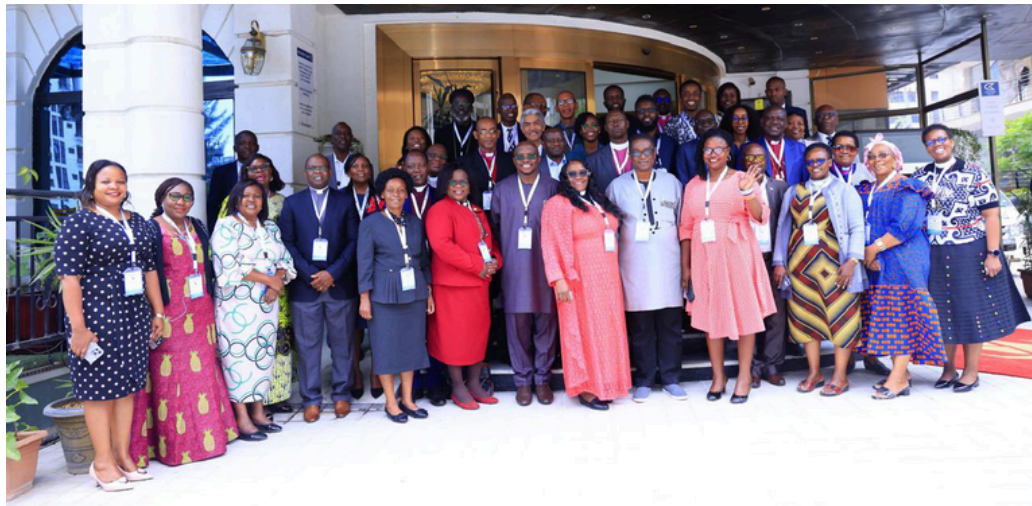
ACHAP and AACC partners at the high-level dialogue on sustainable population growth and development in Africa, hosted by AACC in Addis Ababa.