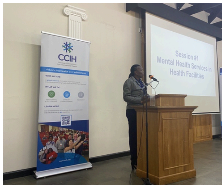
The ACHAP team at the meeting.

Thank you CCIH for this incredible opportunity, and for the wealth of knowledge garnered from the diverse experiences of faith-based health actors across Africa.