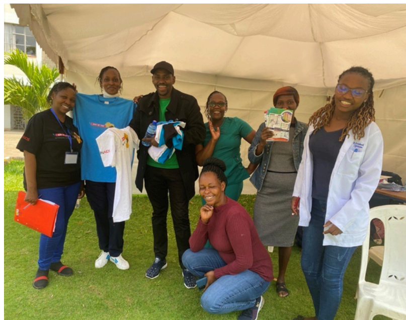
The Jumuiya hospital team at the DAC commemoration event