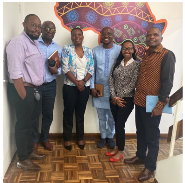
ACHAP and AACC strategy meeting at the ACHAP office in Nairobi.