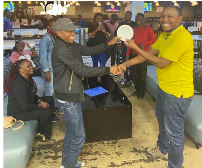
Team building day at ACHAP.