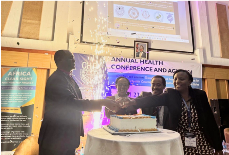
Launching the Kenya chapter of the Africa ClearSight Partnership at the CHAK annual conference in Nairobi.