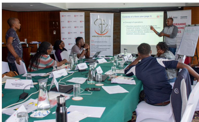
Training in session

Our work in health emergency response is aligned to the Global Health Security goals, as we take on a leadership role in empowering faith-based organisations across Africa to enrich health systems in their respective countries towards resilience and self-reliance.