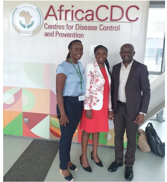
ACHAP visit to Africa CDC in Addis Ababa.